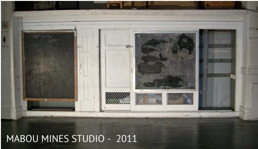
MABOU MINES STUDIO - 2011