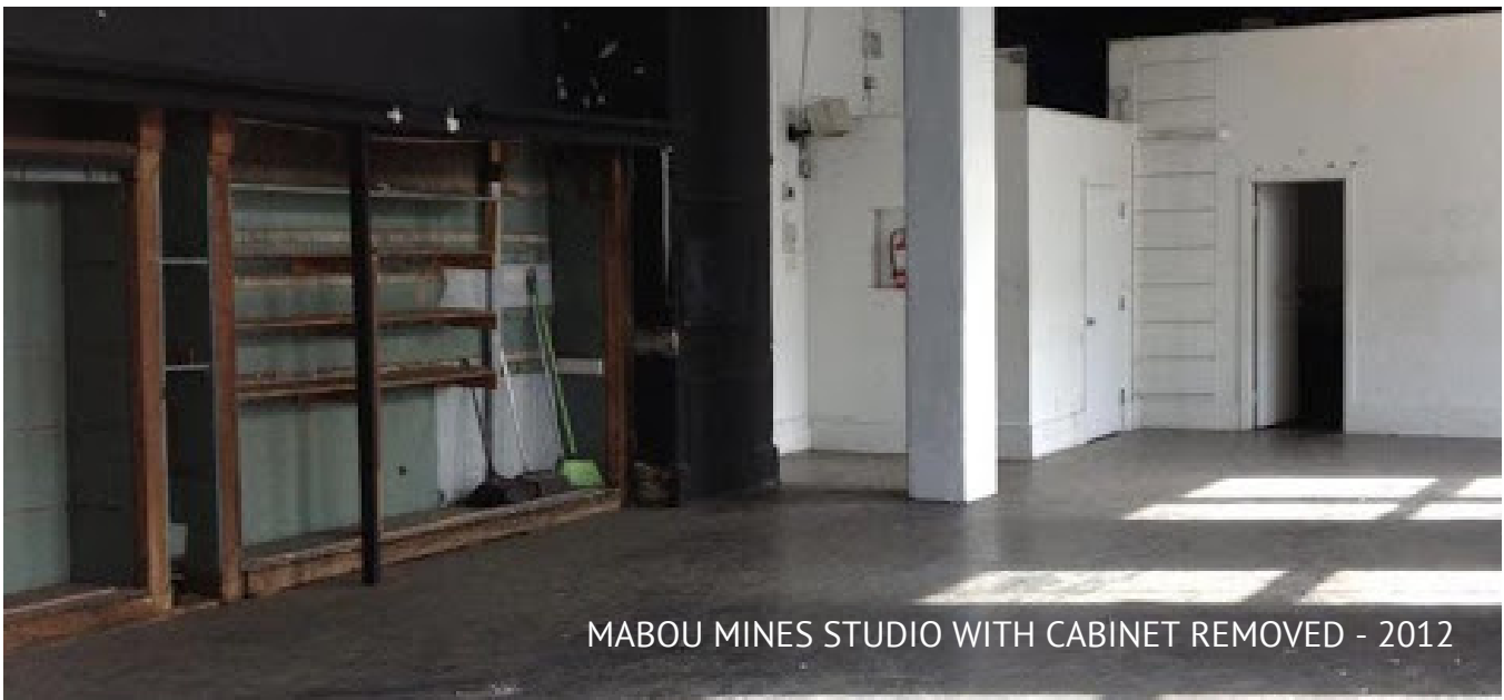
MABOU MINES STUDIO WITH CABINET REMOVED - 2012

2019: Installation completed at CultureHub, New York City.